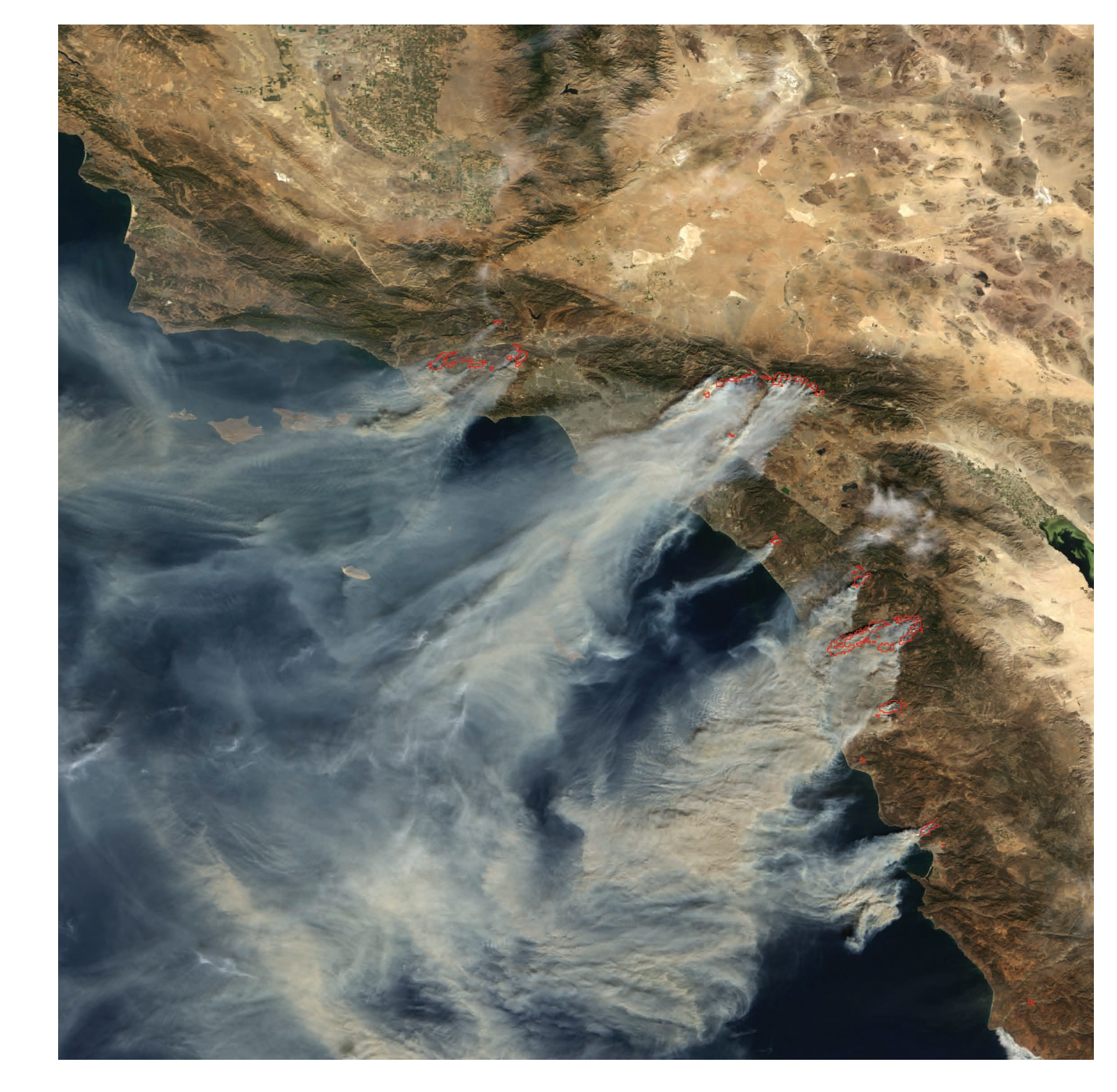
0.47 µm (Blue)